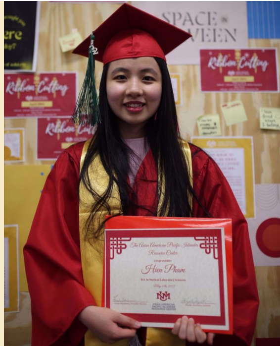
A few of our amazing graduates with their AAPIRC certificates and stoles!